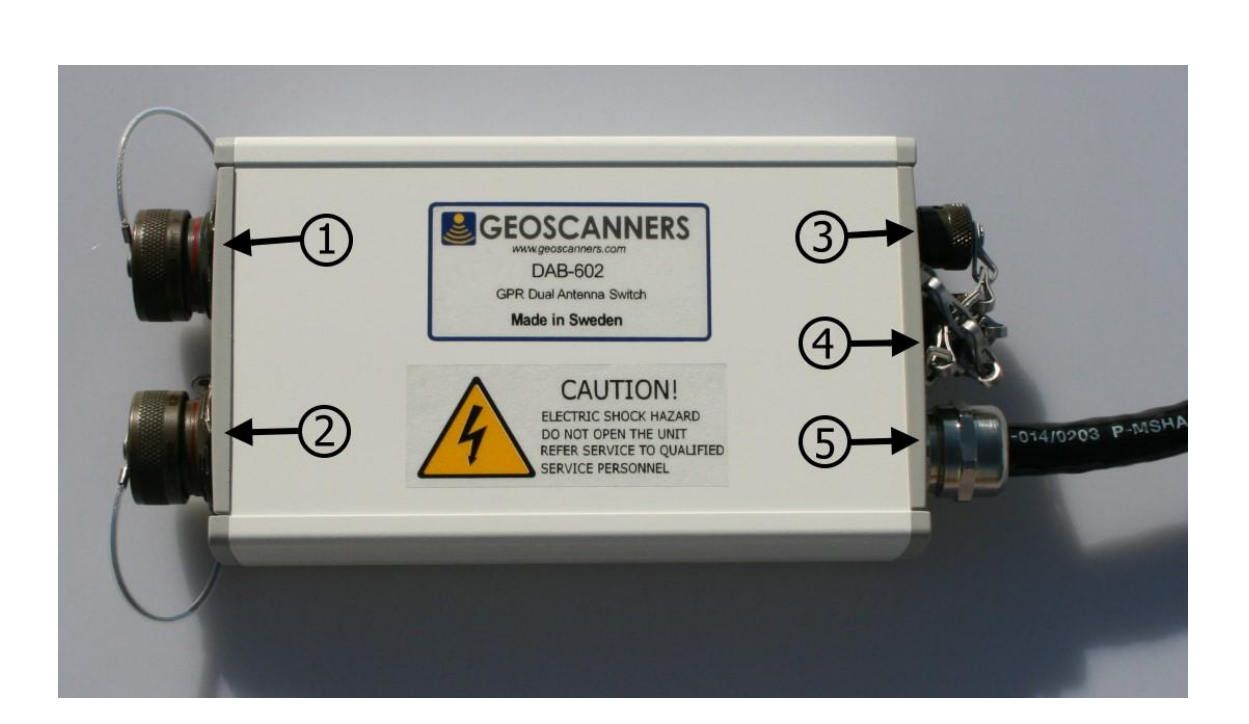
DAB-602 TOP VIEW