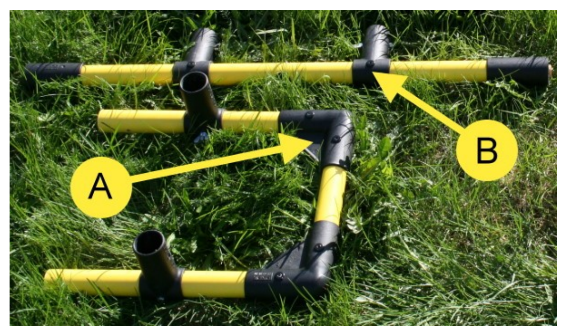
Fig. 6 Rear part consisting of antenna holder connectors assembly and axle.

The rear part with the embedded survey wheel encoder is delivered in two parts. The antenna holder connection assembly and the axle, part A and B respectively in figure six.