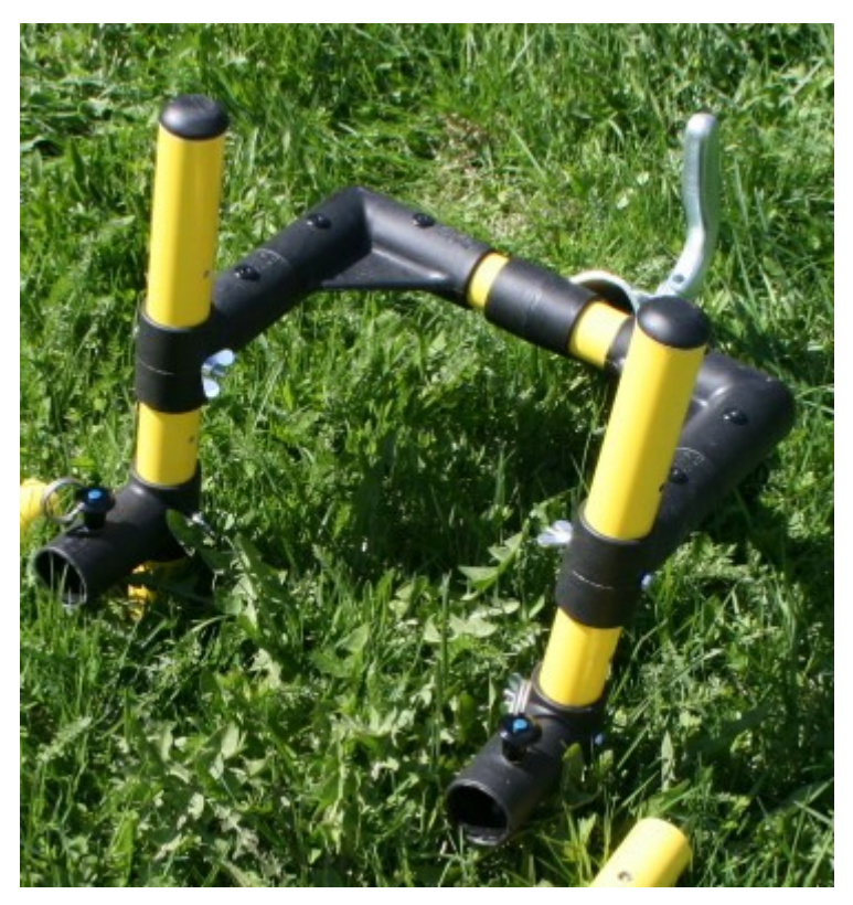
Fig. 5 Assembled front part.

The assembled front part should now look like in picture five.