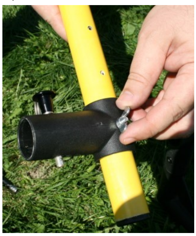
Fig. 1 Remove "T" connector.

The front bars for parallel adjustment are delivered with the "T" connectors attached to them. In order to assemble the front part it is necessary to first remove these connectors. (see fig. 1)