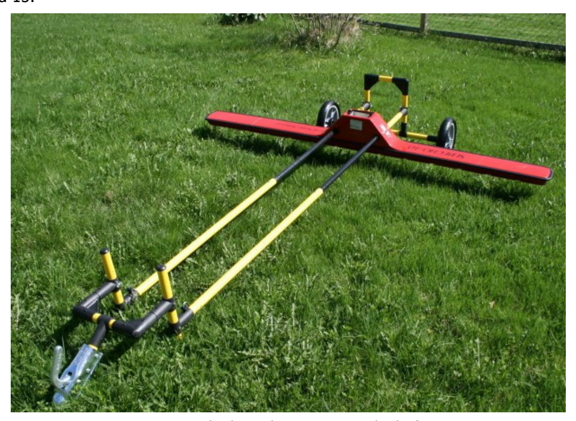
Fig. 14 GPR Trailer kit with antenna attached , front view

Your GPR trailer kit completely assembled should look like the one in the pictures 14 and 15.