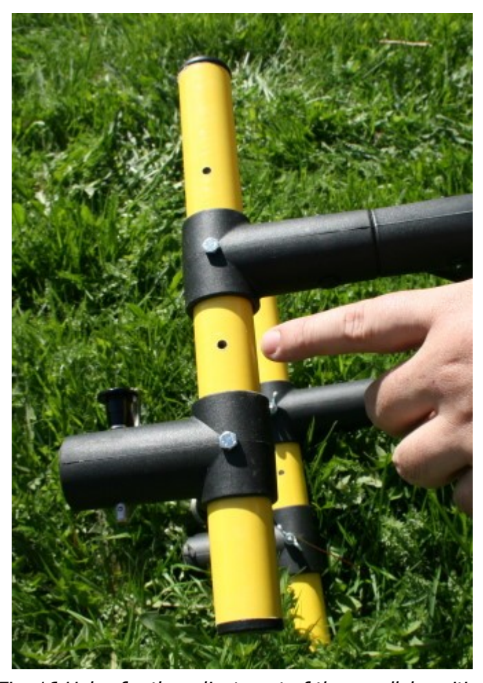
Fig. 16 Holes for the adjustment of the parallel position

The front bars and the bars of the rear part have drilled holes so different positions can be adjusted to obtain a position of the antenna holders parallel to the surface (see fig. 16).