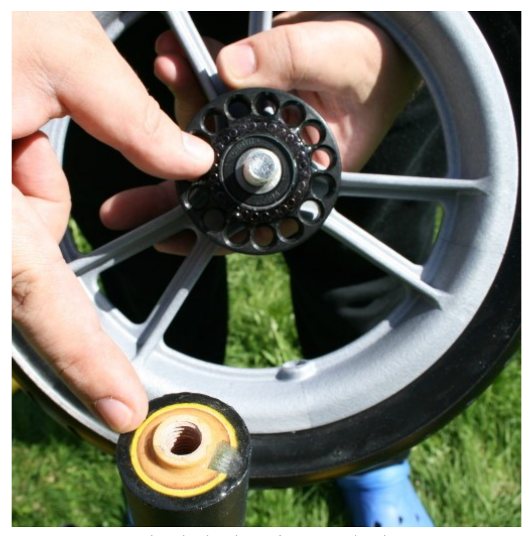
Fig. 7 Encoder wheel and encoder mounted in the rear axis.

The encoding wheel has a magnetic ring attached to it. The side of the axle with the encoder contains an electronic board sealed with epoxy. These two parts have to be mounted facing each other. Failure to do so will render the embedded encoder useless.