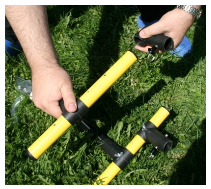
Fig. 4 Insert back the antenna holder connectors.

The assembled front part should now look like in picture five.