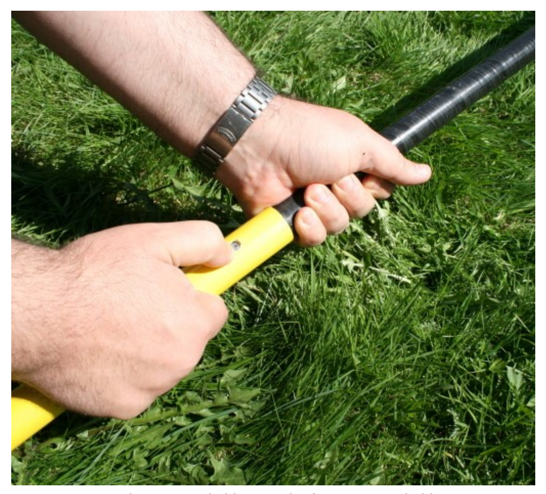
Fig. 10 Insert the antenna holder into the front antenna holder connector.

snap button with the hole in the front antenna holder connector. Press gently the snap button and insert the antenna holder in the connector until the snap button secure the connection of the two.