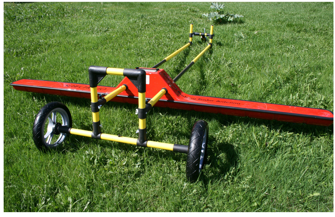
Fig. 15 GPR Trailer kit with antenna attached, rear view