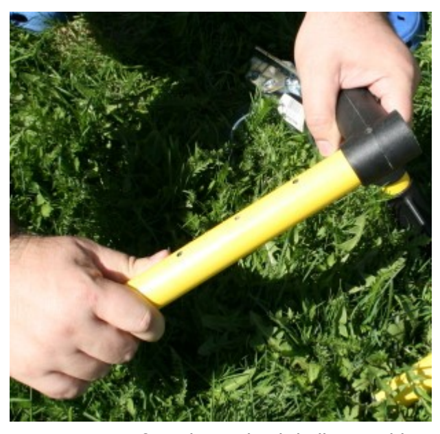
Fig. 2 Insert front bar in hitch ball assembly.

Insert the front bar for parallel adjustment into the "T" connector in the hitch ball connection assembly (see fig. 2). Pay attention to the fact that one end of the front bar is flat and another is rounded (see fig. 3). You should insert the flat end, the rounded end will not go into the "T" connector. Insert the front bar all the way up to the third hole in the bar making sure that the holes in the bar and the holes in the "T" connectors are aligned. Secure the two with the supplied bolt and wing nut. The position of the "T" connector can be changed later on if the parallel adjustment of the antenna requires to do so.