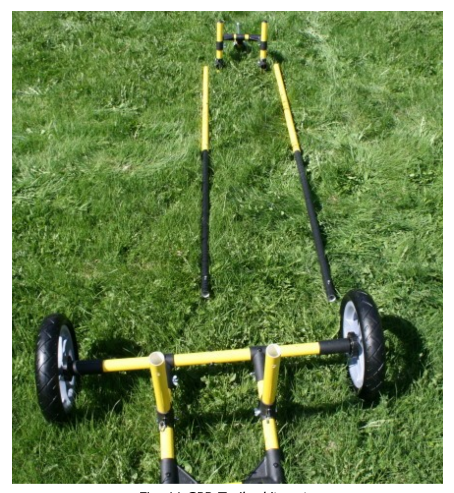
Fig. 11 GPR Trailer kit parts.

Mount the antenna you are planning to use on the antenna holders (see fig 12). Secure the antenna with the bolts pressing against the antenna holder.