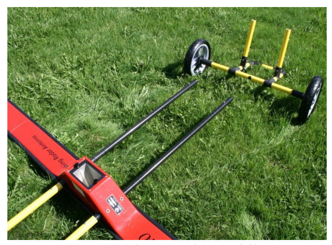
Fig. 12 Mounting the antenna in the antenna holders.

For the final assembly insert the antenna holders into the rear antenna holder connectors and secure them with the help of the snap button (see fig. 13)