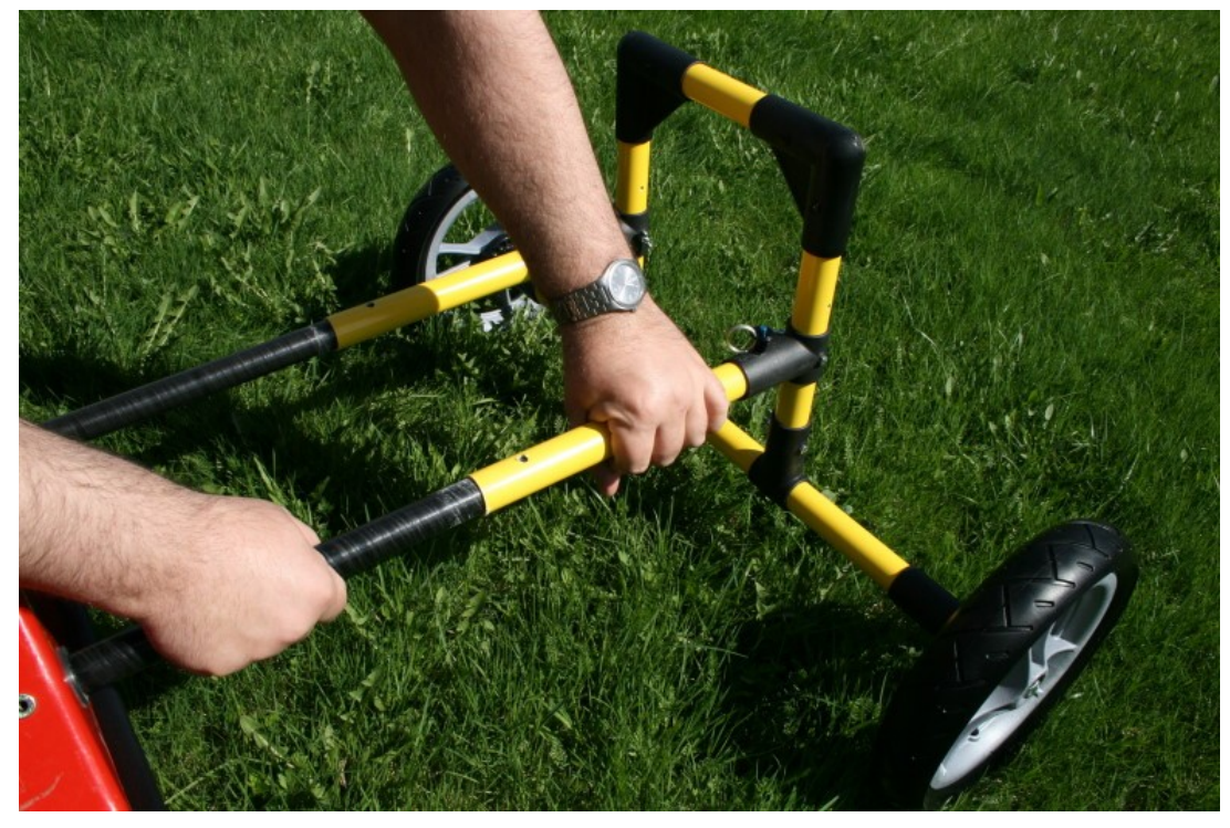
Fig. 13 Assemble the antenna holders into the rear connectors.

For the final assembly insert the antenna holders into the rear antenna holder connectors and secure them with the help of the snap button (see fig. 13)