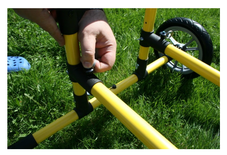
Fig. 8 Securing rear antenna holders with pins.

If for some reasons the rear antenna holder connectors are mounted in the wrong way, then the securing pins will still go in, but the snap button of the antenna holders will not fit and the holder will not be secured.