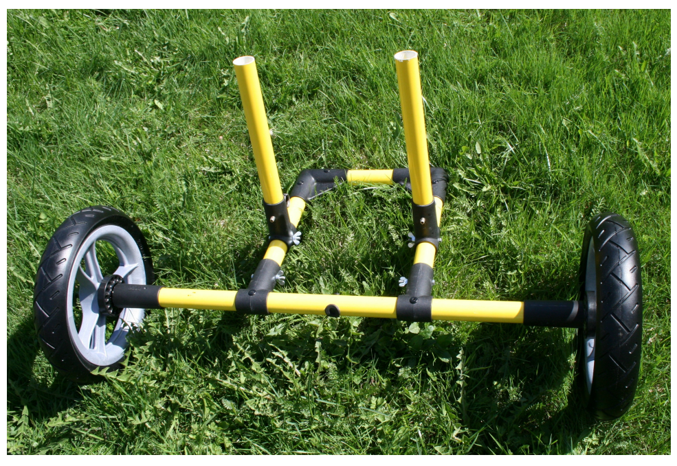
Fig. 9 Assembled rear part.

The assembled rear part should now look like the one shown in picture nine.