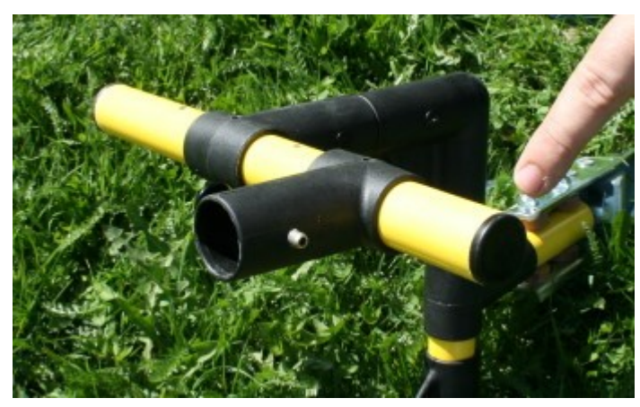
Fig. 3 Flat end of the front bar.

Once both front bars are inserted and secured in the hitch ball assembly, insert the "T" connectors for the antenna holders that were removed earlier (see fig. 4). Insert them so the holes in the "T" connectors and the first holes in the front bars are aligned. Notice that those are looking in the opposite direction than the hitch ball. Secure the assembly with the supplied bolts and wing nuts.